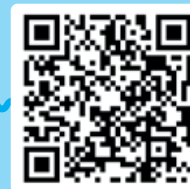
Final sound of the incident