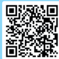
Initial evacuation warning sound